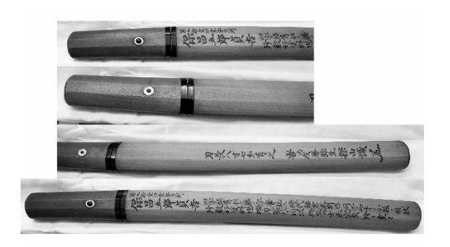
Figure 5 below includes a variety of views of a partially-cleaned shirasaya , where the sayagaki was added after the shirasaya was cleaned. For this restoration, the original patina was removed from only a portion of the shirasaya prior to the addition of the sayagaki later on. As a result, none of the sword's history was lost; in addition, traces of the original patina are clearly visible on other parts of the shirasaya , thus authenticating its age. European restorers would be pleased to see so much evidence of the sword's history.